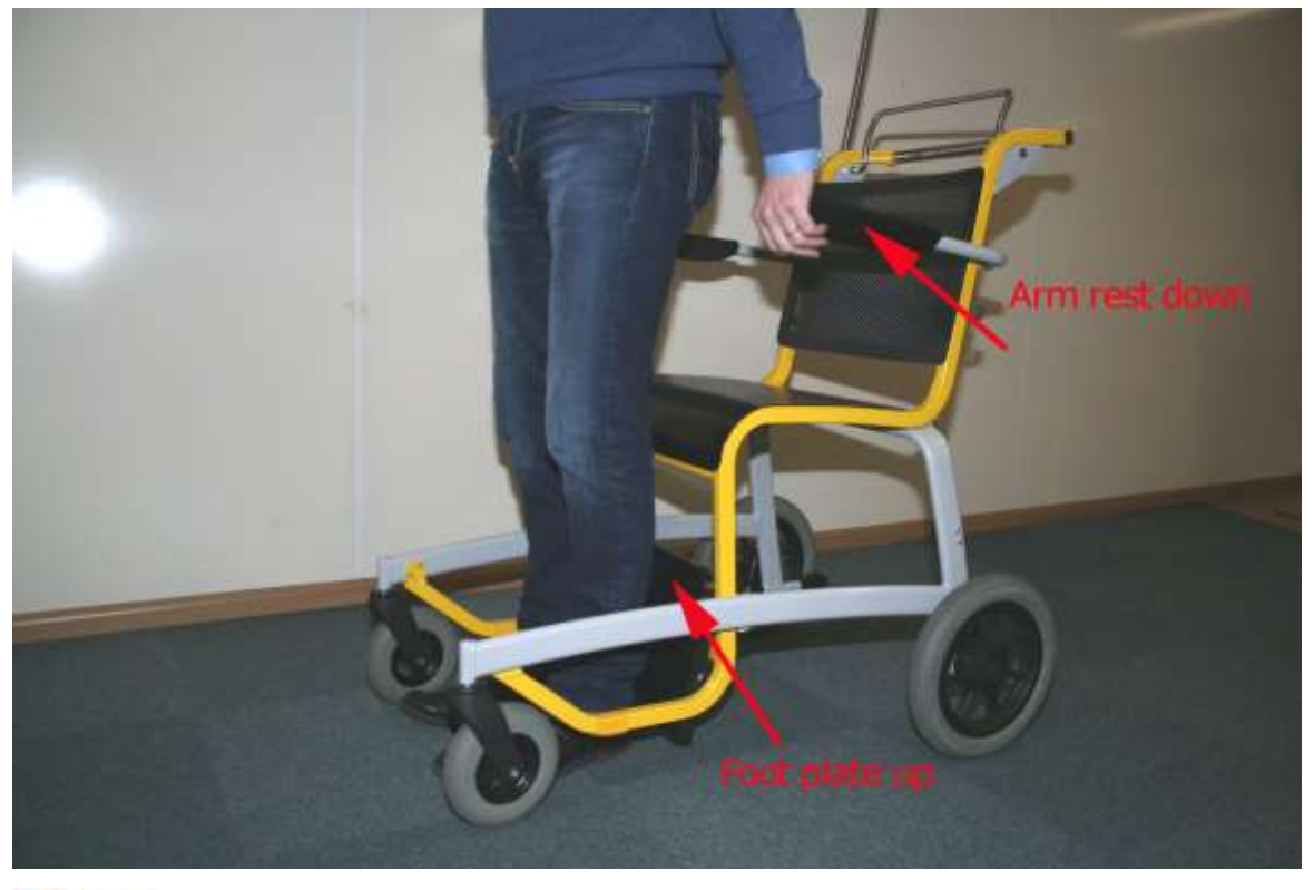
Step 1: The armrest placed down and the foot plate up. Collide with the seat at a small distance from the knee.